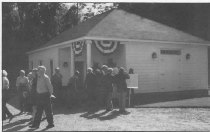
The archives building: an exterior view.